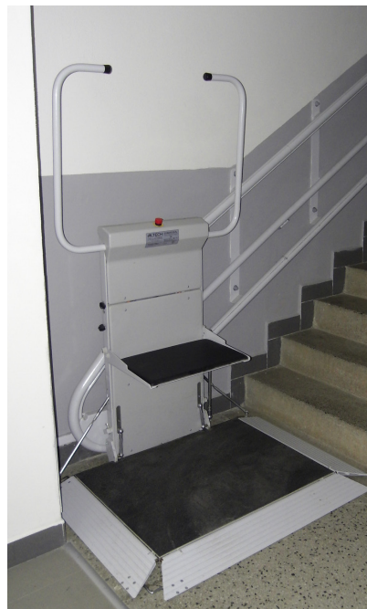
Special platform sizes and asymmetrical shapes to custom fit any staircase and maximize user friendliness!