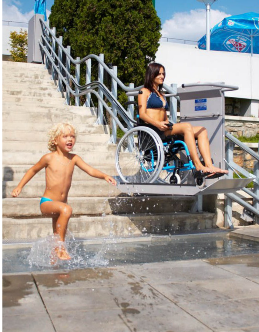
Robust platform mechanics allow installation in cold or wet locations

Fully automatic platform functions and ergonomic controls allow a simple and comfortable control of the platform.