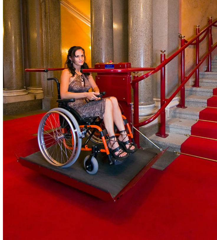
Available in any RAL colour, the platform can blend elegantly into any surrounding