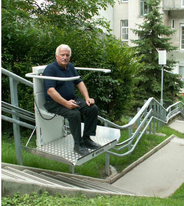
The drive without batteries allows for very long rail lengths