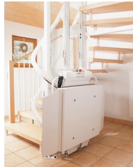
Very slim platform – The folded platform allows to comfortably store away the platform