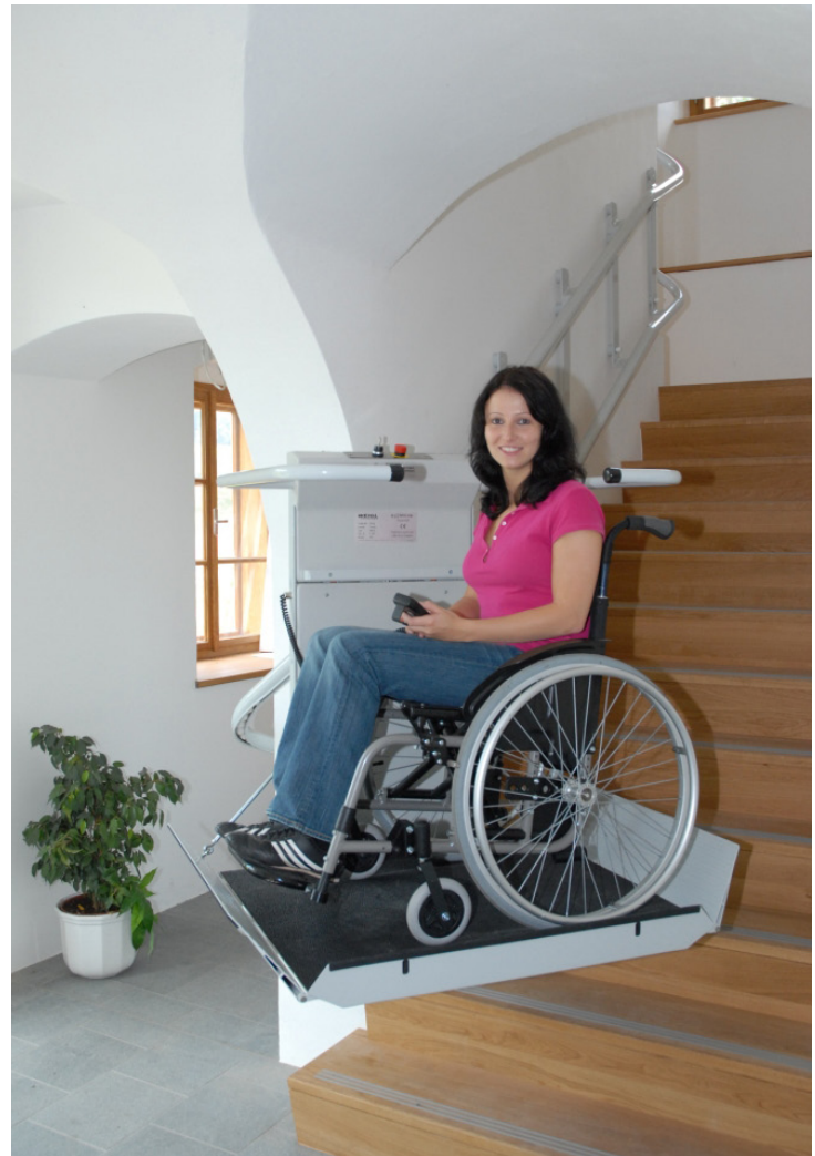
Rail fixing directly to the wall allows for a maximum platform size