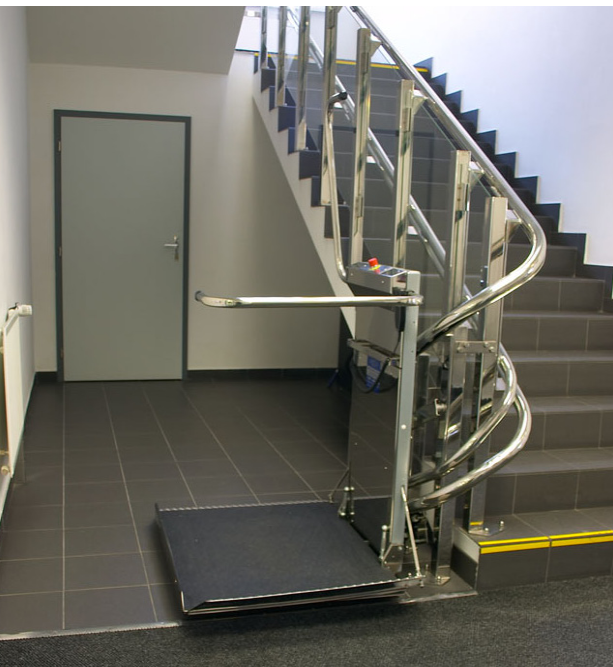
Available in a stainless steel version, the platform fulfils highest architectural standards